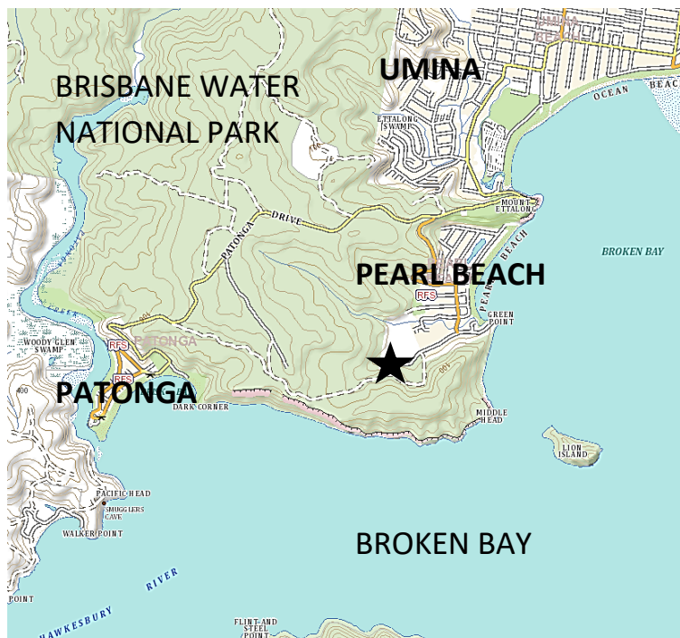
Left: Location of Pearl Beach between Umina and Patonga on the Central Coast of NSW, 1.5 hours’ drive north of Sydney. The Arboretum location is shown by the star.

This Artist in Residence Program – including the involvement of a local emerging artist – is part of Central Coast Council’s Creative Art Central Program.