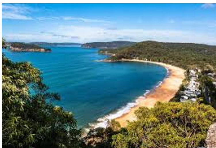
View of Pearl Beach from the North.

Information on the types of weekly accommodation for rent by an artist in residence can be seen on these websites: Koorawatha Pearl Beach LINK ; Pearlie LINK ; Chillout LINK ; Umina Beach LINK .