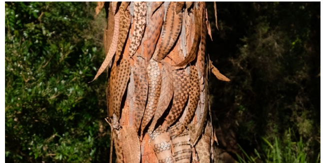
Skirting the Issue 2022 by Georgi Galea