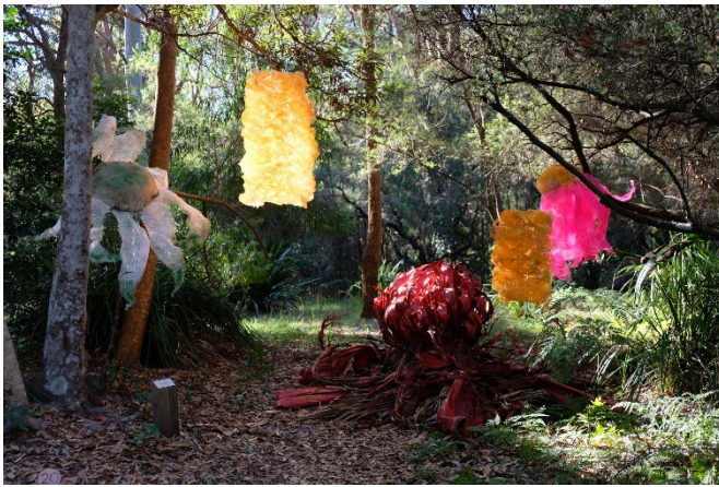
Which Super Wildflower are You? 2023 by Ferguson & Westcott