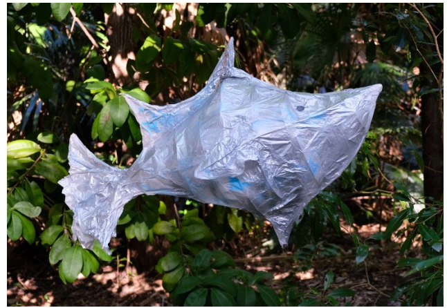
Octopus's Garden 2023 by Malcolm Davison