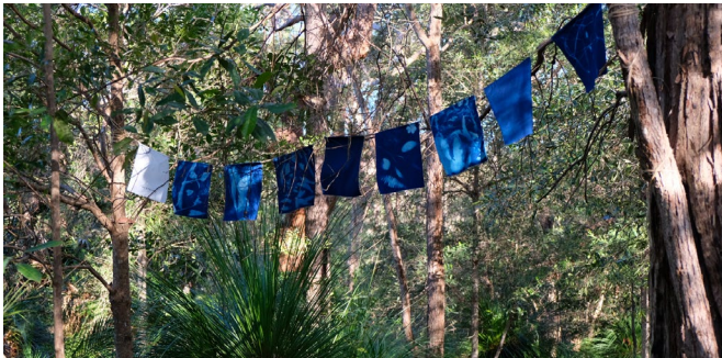
Blue Banners 2023 Community Workshop & Installation